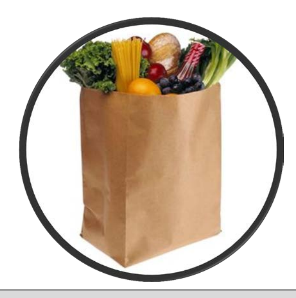
Make a shopping list of healthy food choices to keep temptations out of your home.